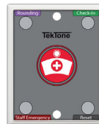
single bed multifunction station