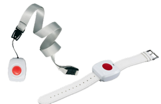
pendant transmitter with wrist band option