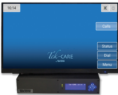
Tek-CARE ® Appliance Server with Tek-CARE ® Reporting Software